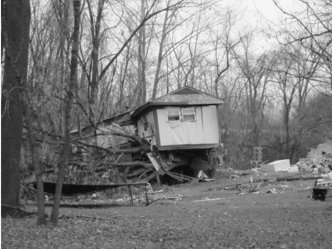
A scene close to Swatara Creek north of Annville showing some destruction caused by the September 2011 flood as seen by participants in QAS's Christmas Bird Count on 12/17/11.