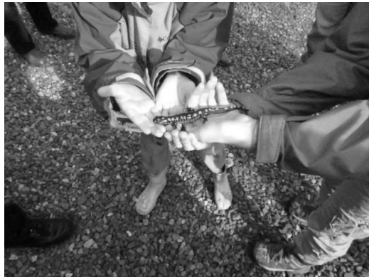
Spotted salamander seen at Swatara State Park