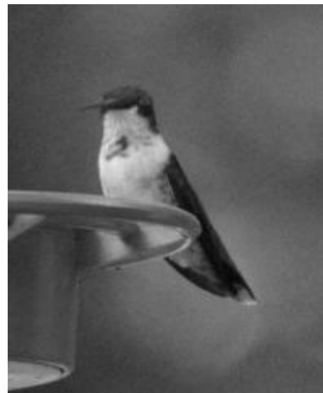
Young Ruby-throated Hummingbird

The small non-native plant, purple dead nettle ( Lamium purpureum ), was growing profusely in the fields. This plant is in the mint family ( Lamiaceae ) – plants that have square stems. In some literature the flowers are suggested to resemble snapdragons; in others, stinging nettles. However, this is a “tame dragon” and has no sting, so it is a dead nettle.