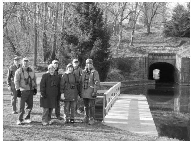
Union Canal Field Trip Participants

Great weather provided an enjoyable walk on both the south and north portal areas of the park. We observed 18 species which included a kingfisher, red-tailed hawks, a mockingbird, and a half dozen gadwall ducks. Also of note: 137 common grackles mixed in with crows that were constantly flying overhead.