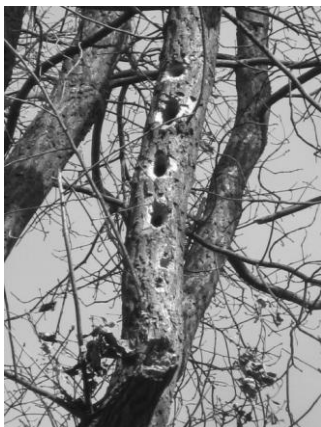
Pileated woodpecker's handiwork in a tree at Coleman Memorial Park, Lebanon.

To see the entire lawsuit go to PEDF's web site at: www.pedf.org .