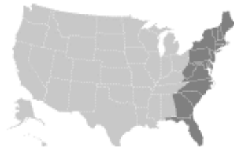
The Atlantic Flyway

Through this periodic "Flyway Update" we'll keep you informed as this initiative takes shape and turns into meaningful action steps that we all can do together.